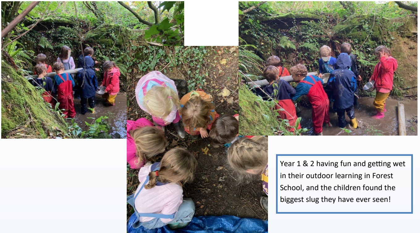
Year 1 & 2 having fun and getting wet in their outdoor learning in Forest School, and the children found the biggest slug they have ever seen!